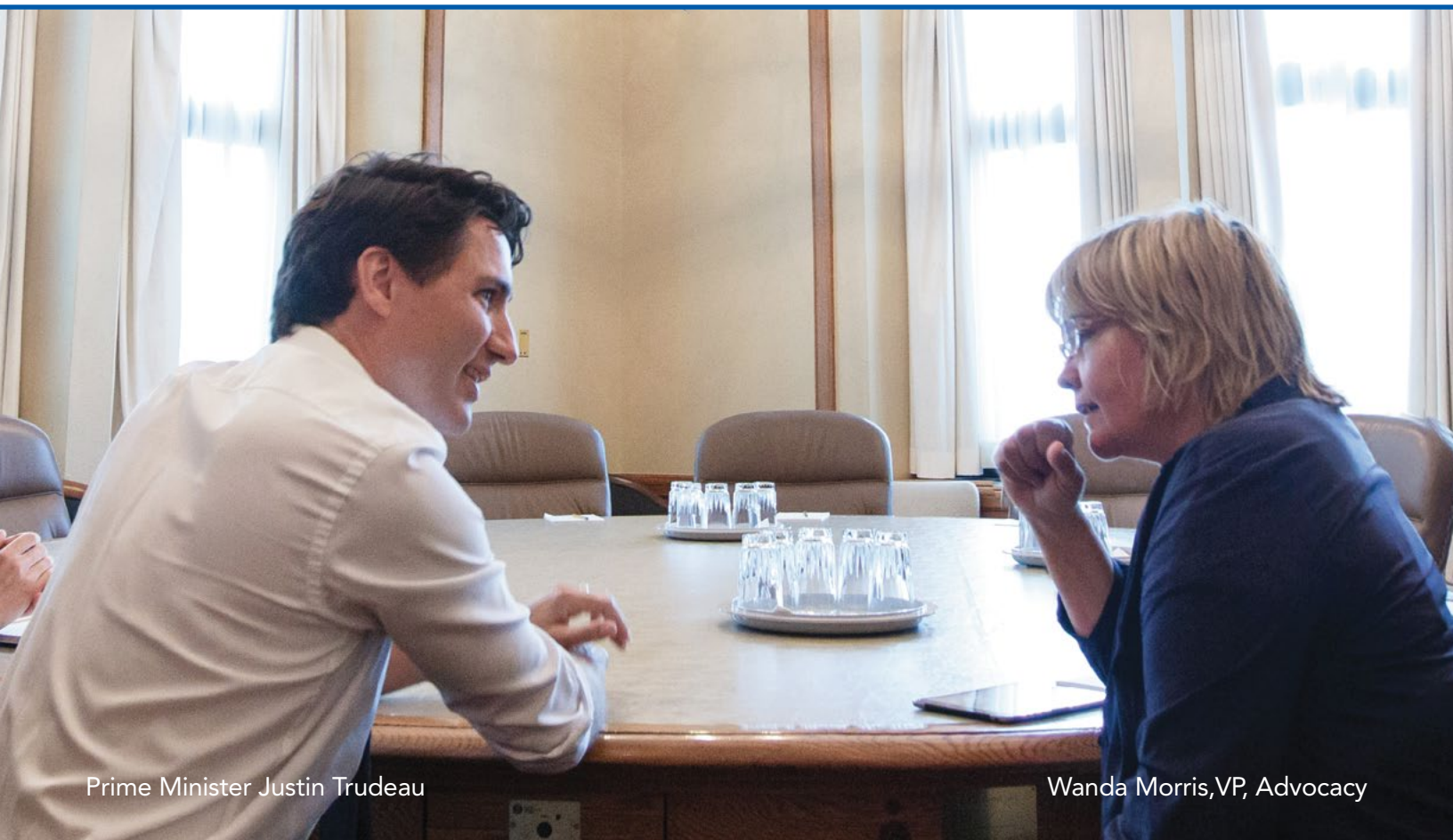
Prime Minister Justin Trudeau